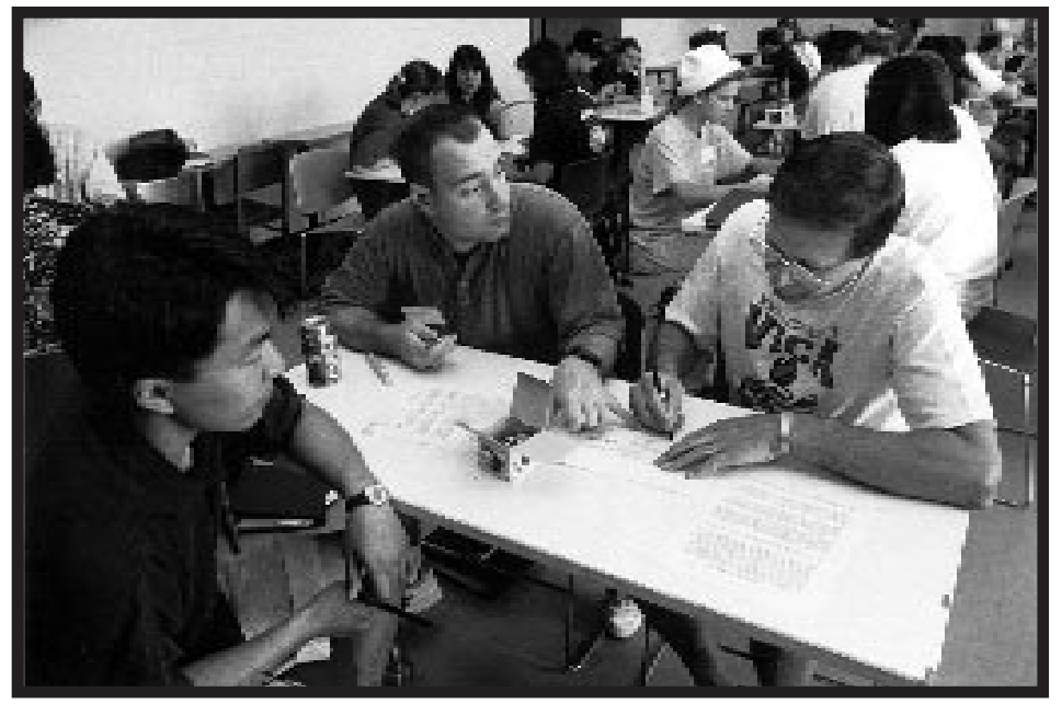
But to recast education in these terms requires changes in how the school is operated and how student learning is evaluated.

Focus on a large societal-technical system (often an urban system such as water supply and treatment or mass transit—sometimes a commercial system such as air transport) allows the student to bring to the table some knowledge or at least acquaintance with the subject, and more importantly, faces student and teacher alike with a situation rather than a discipline; a variety of learning styles are appropriate; a range of disciplinary inputs are required and several approaches or answers are acceptable.