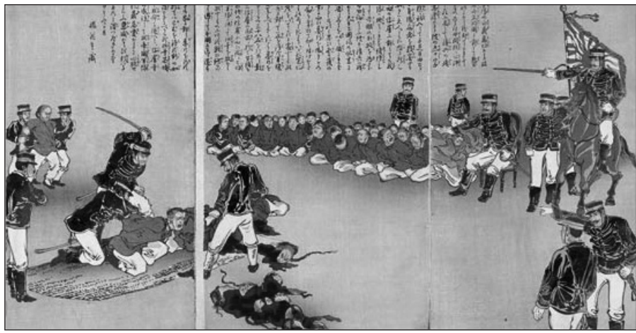
Illustration of the Decapitation of Violent Chinese Soldiers Visualizing Cultures presents images from the uncensored historical record as part of scholarly research. Be advised that some images may be offensive and difficult to view; presentation of these images does not endorse their content.

"Westernization" had entailed, for Japanese, adopting the white man's imagery while excluding themselves from it. This poisonous seed, already planted in violence in 1894-95, would burst into full atrocious flower four decades later, when the emperor's soldiers and sailors once again launched war against China."