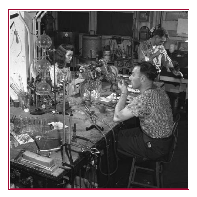
Glass blowing in the Rad Lab (Building 52) during World War II.