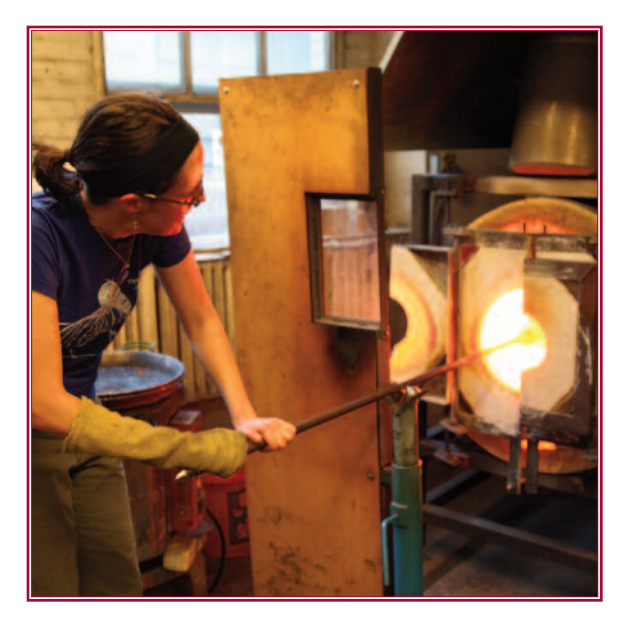
A glass blower in the MIT Glass Lab creating a glass pumpkin.