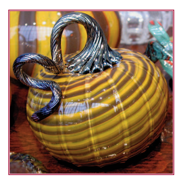
MIT Glass Lab pumpkin.