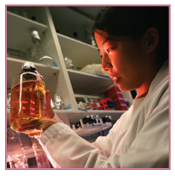
Glass used in an MIT Research Lab.