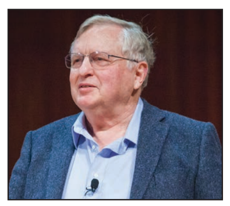
The following is slightly abridged from the original which appeared in the July 19, 2019 MIT News.