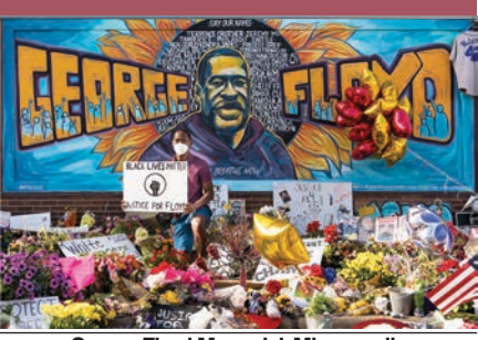
George Floyd Memorial, Minneapolis

Whiteness continues to be weaponized and black lives continue to be criminalized. Endlessly, everywhere, we are surveilled and policed. On a whim or with a casual flexing of the muscle of white privilege, we are removed from